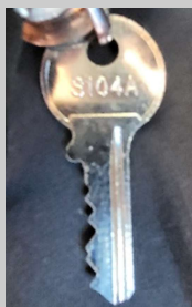
Figure 4 – S104A key