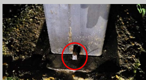
Figure 6 – Drop post padlock eye