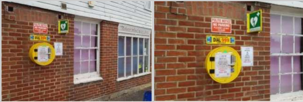
Figure 1 – The News Store AED