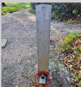
Figure 5 – Drop post padlock