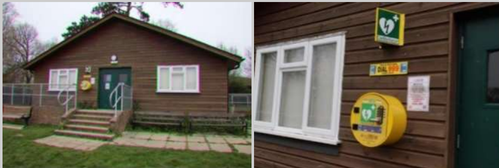
Figure 2 – John Pears Pavilion AED