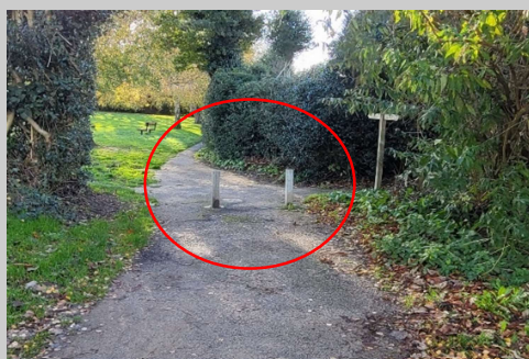
Figure 3 – Wray Close vehicle access drop posts

Wray Close (vehicle pitch access through garage block): flush.region.spreading